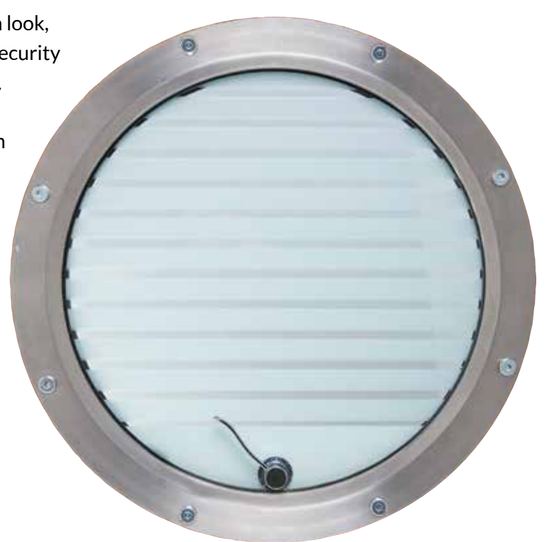
Featuring optional stainless steel beading.