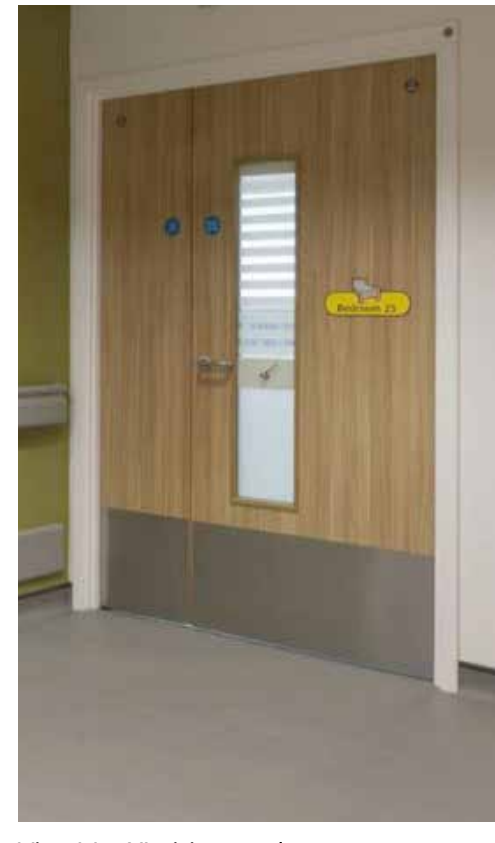
Vista Max XL vision panels come with a lifetime warranty against faulty manufacture.

An optional extra is the Vista Glide damper. This soft-closing damping system ensures panels close with a minimum of effort and noise. This is especially effective on the larger size panels of the Vista Max XL.