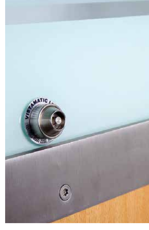
As with all Vistamatic products, the Vista Safe carries a Lifetime Warranty against faulty manufacture.

Also standard is our Vista Glide damper. This soft-closing damping system ensures panels close with a minimum of effort and noise. This is especially useful where observation is needed throughout the night.