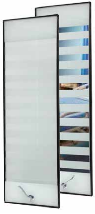
Vista Max vision panels come with a lifetime warranty against faulty manufacture.

An optional extra is the Vista Glide damper. This soft-closing damping system ensures panels close with a minimum of effort and noise. This is especially effective on larger panels and where observation is needed throughout the night.